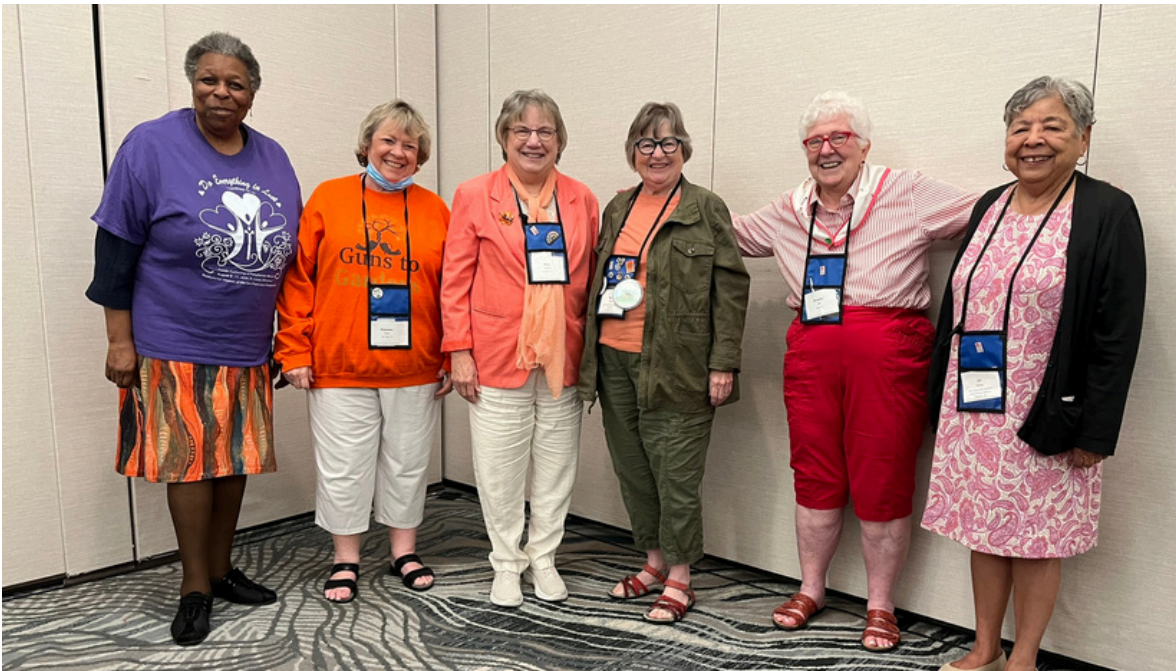
Synod of the Pacific PW Coordinating Team