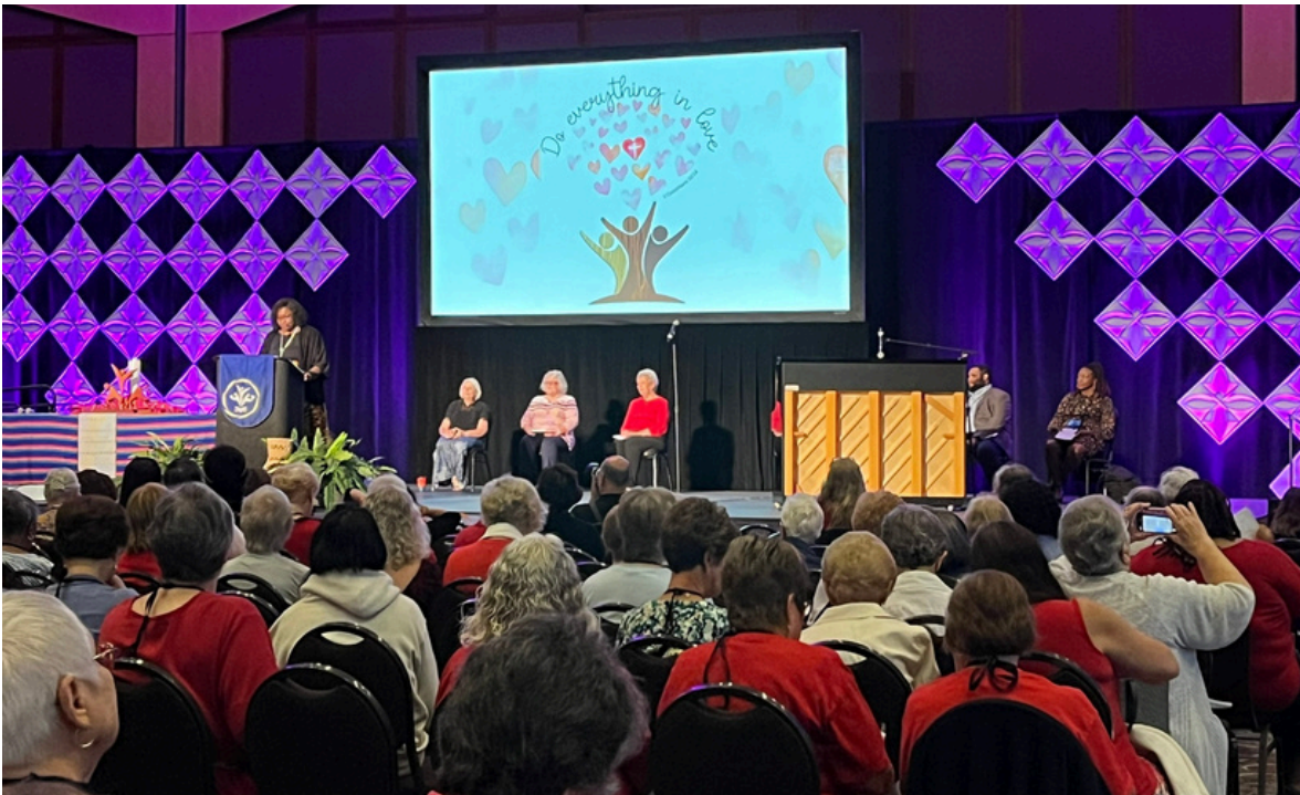
Plenary Hall where we met in the morning and evening