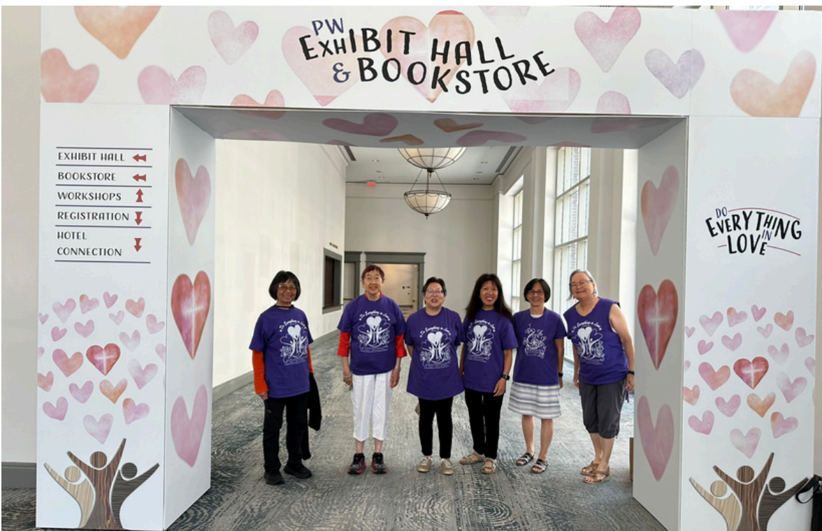
Women from the Presbyterian Church in Chinatown wearing the PWP-SF t-shirt.